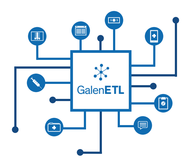
Rapid, reliable, secure, and scalable interoperability between health information systems, helping our clients deliver connected solutions.

The Galen team proved to be collaborative and nimble. Their GalenETL solution was instrumental in empowering our organization to efficiently, rapidly and effectively connect our participant healthcare organizations to realize the tangible benefits of care coordination fueled by CCNC.