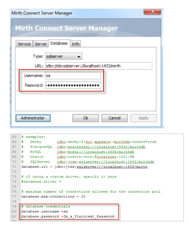
Figure 1.1: (Top) Database connections settings in the Mirth Connect Server Manager and (bottom) how they are stored in plaintext on the server.

To correct this vulnerability, an additional encryption setting can be enabled in the mirth.properties file that will prompt the mirth service after a restart to rewrite all plaintext passwords from then on to an encrypted, nonhuman readable format.