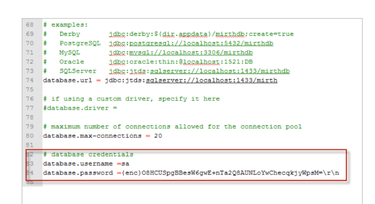
Figure 1.3: Mirth.properties file after encryption settings have been set. The database.password property is now properly encrypted.

Figure 1.2: After setting the encryption property shown here to 1, all password fields will be encrypted.