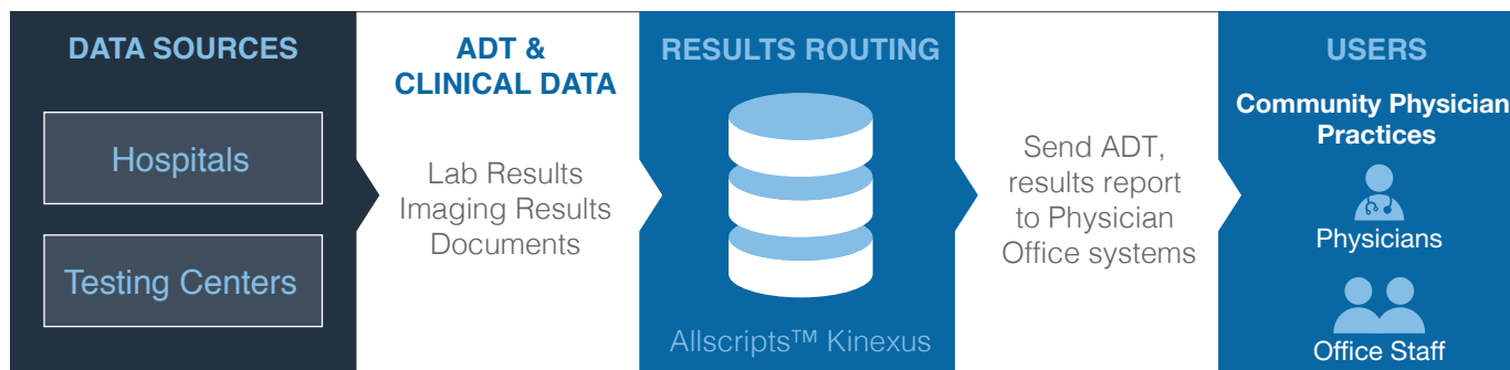
Figure 2. Results Delivery (Kinexus) Data Flow Overview